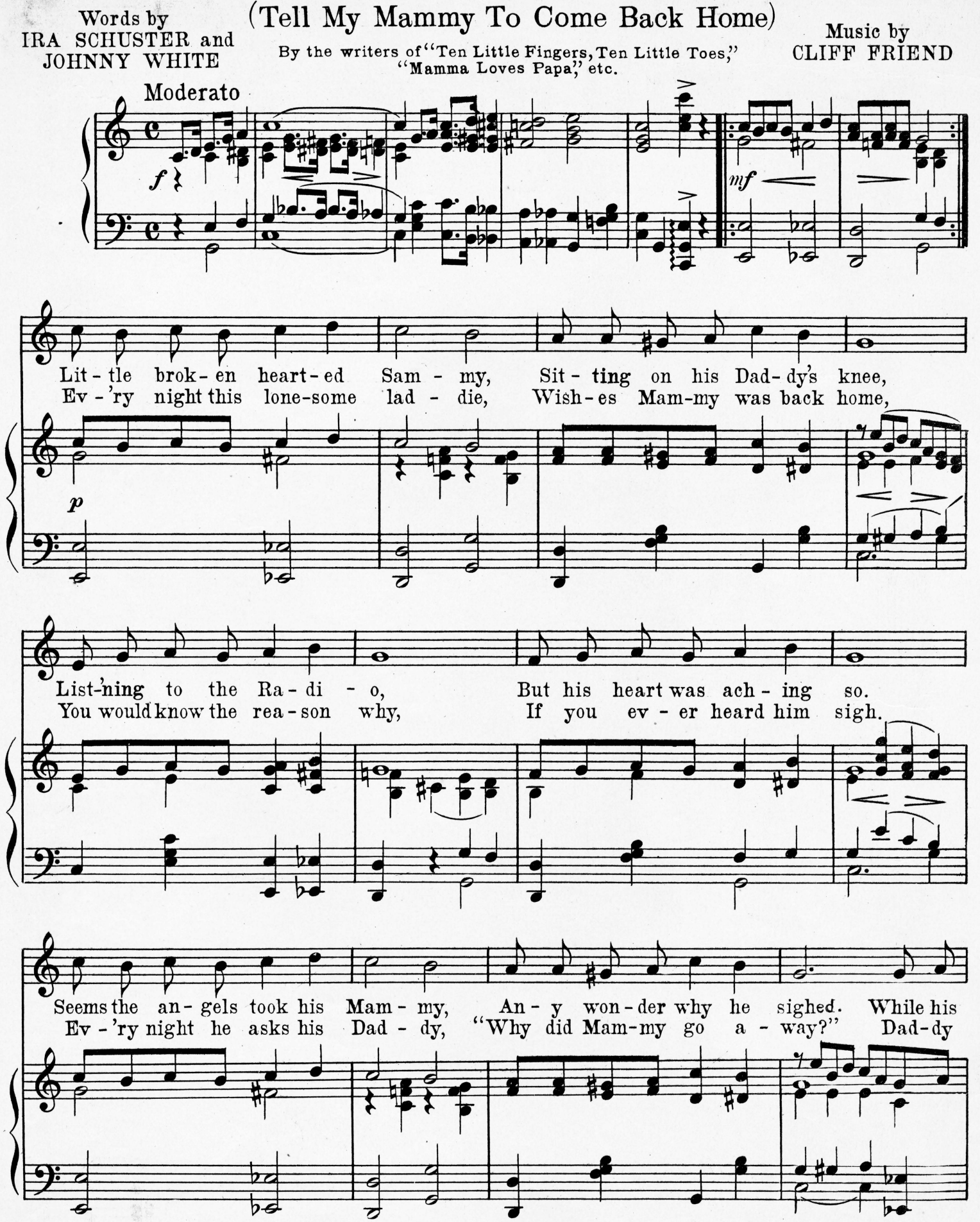
Copyright MCMXXIV by LEO. FEIST, Inc., Feist Building, New York International Copyright Secured and Reserved London-England, Francis, Day & Hunter, 138-140 Charing Cross Road Toronto-Canada, Leo. Feist Limited, 193 Yonge Street