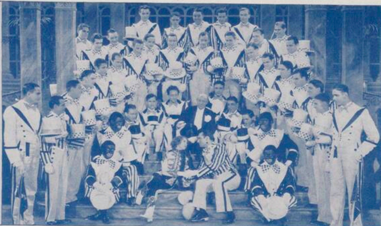
MINSTREL SHOW SCENE FROM "THE GRAND PARADE"